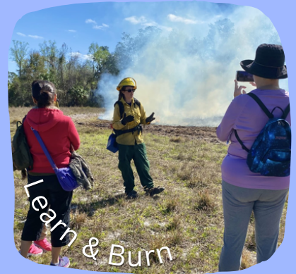
Learn & Burn