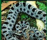
DUSTY PIGMY RATTLESNAKE